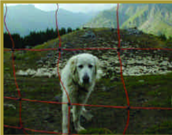
A Pyrenean mountain dog stands guard over a flock of sheep in France where wolves have recently returned