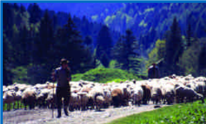
Traditional livestock guarding techniques are still used in Romania where shepherds and guarding dogs provide effective protection against large carnivores

The last 30 years have seen a tremendous shift in policy towards large carnivore species. Management objectives have switched from extermination to conservation. Populations of wolf, lynx and brown bear have begun to recover in many areas of Europe through natural recovery and active reintroduction. However, when large carnivores return to human-dominated landscapes many of the old conflicts return.